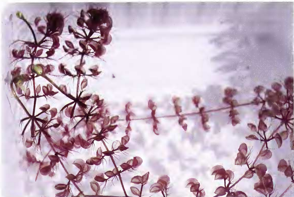
Figure 1: Flowering Aldrovanda vesiculosa from north Australia grown in indoor aquarium, September 1998.